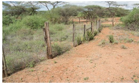
Development Assistance for Rural Education