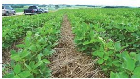
Land Stewardship Project