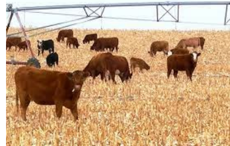
University of Nebraska-Lincoln