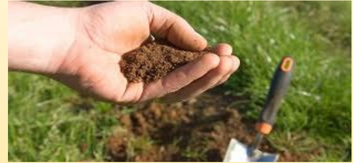
Free Soil Testing