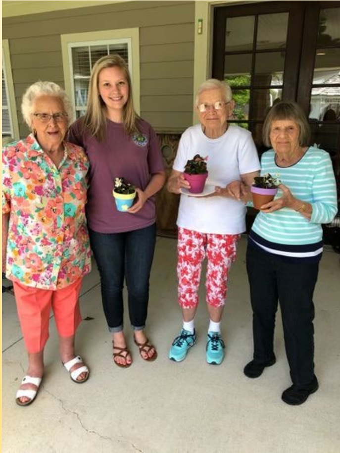
Senior Living Workshop