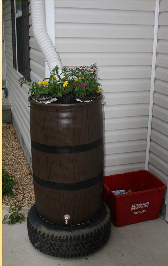
Rain Barrel Workshops