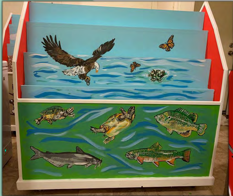
Mississippi Coastal Region Book Barn