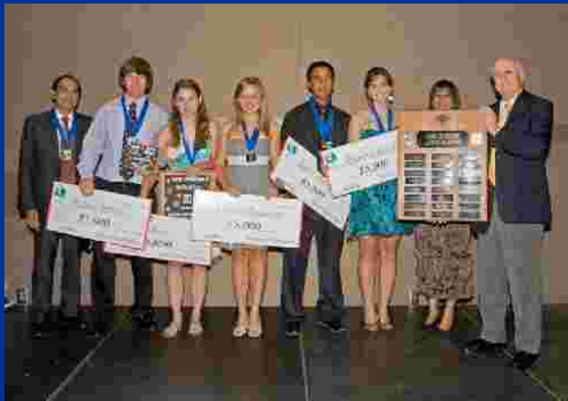
Canon Envirothon Champions