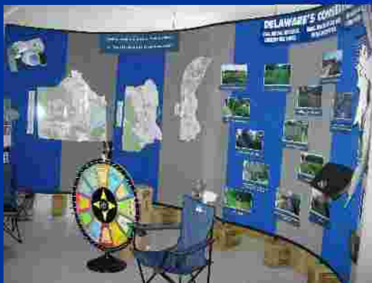
Delaware State Fair