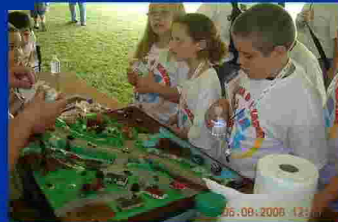
DE/MD Joint Water Festival