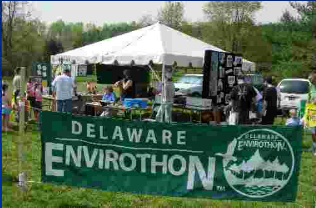
DSWA Earth Day Celebration