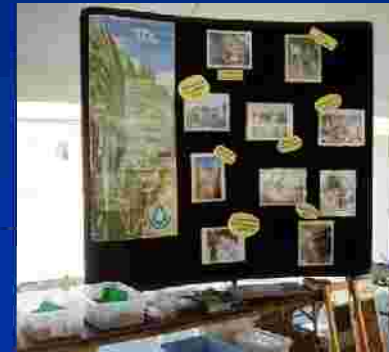
University of Delaware Ag Day